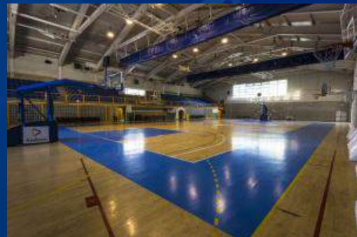
JOAN ALAY PAVILION

At all times, the gymnasts will be accompanied and informed by those responsible for the event to ensure compliance with schedules and safety.