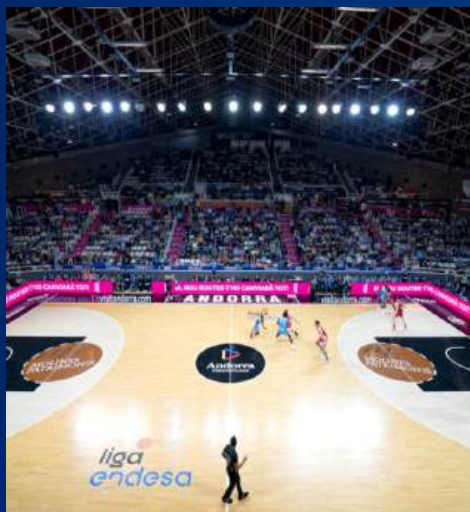
TONI MARTÍ PAVILION